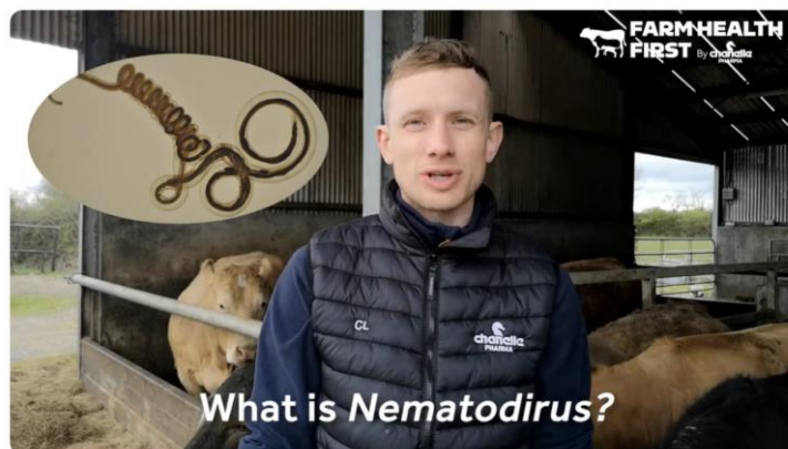
Beating Nematodirus - Protect Your Lambs this Season

Please contact your vet directly if you have queries on worming your flock